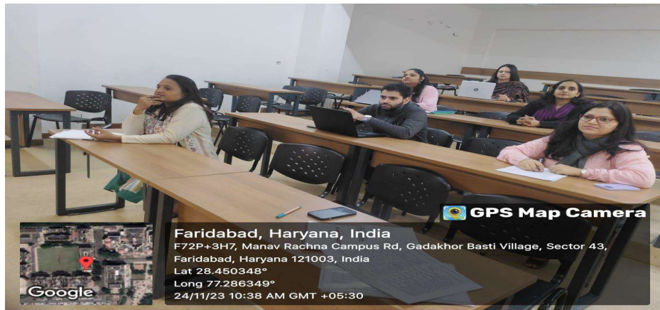
Participants attending the online session