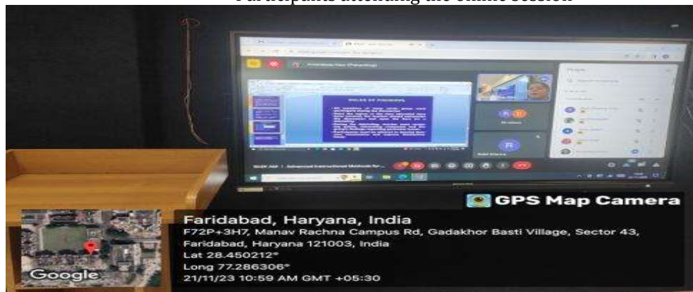
Online session in progress

Evaluation Tools for Assessment. ” The discussion and hands on training was given on various platforms such as Answergarden, Chatzy, COGGLE, Pollseverywhere, etc.