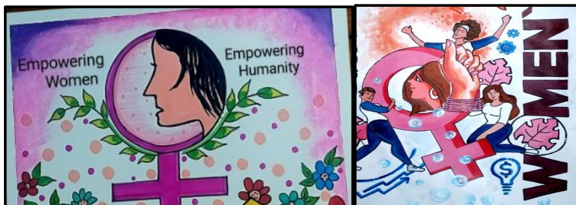
Submissions from students

MRCPS's innovative approach, merging the realms of art and activism, reinforces its commitment to building a more equitable and inclusive society. By leveraging the universal language of visual art, the organization aims to amplify the call for women's empowerment and gender equality, effectively engaging a broad audience and fostering a collective commitment to social progress.