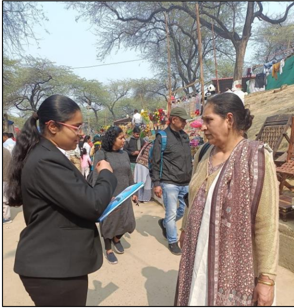
Students talking to visitors for legal aid awareness at Surajkund Mela 2024