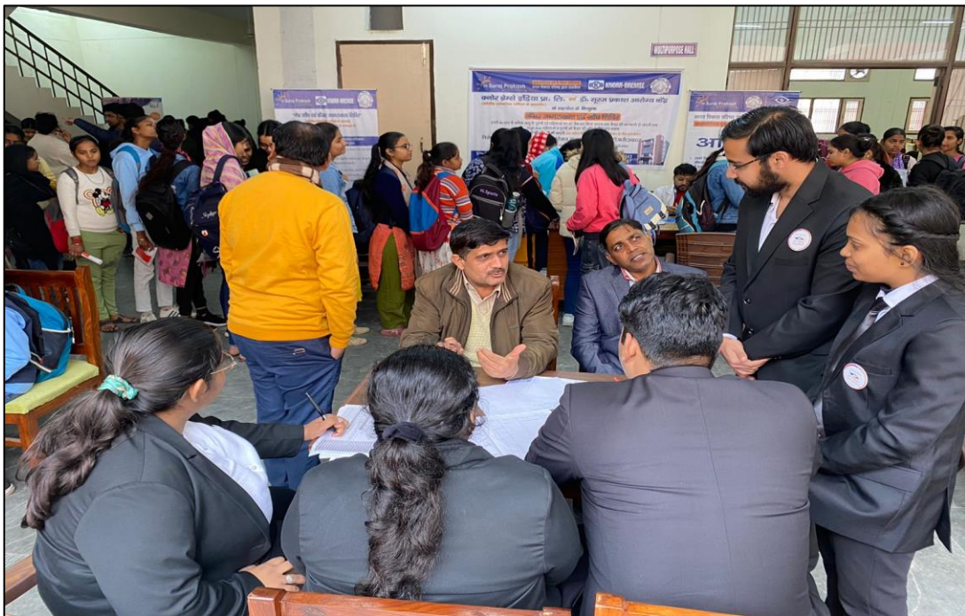
Student Interacting with the Residents

The Legal Aid Camp at Rawal Institutions, Sohna Road, served as a valuable platform for promoting access to justice and empowering individuals within the community. By offering essential legal assistance and guidance, the event contributed to fostering a more equitable and inclusive society. The success of the camp underscores the importance of continued efforts to expand access to legal aid and uphold the fundamental principles of justice for all members of society. Moving forward, sustained collaboration and advocacy efforts will be essential to address the ongoing legal needs of the community effectively.