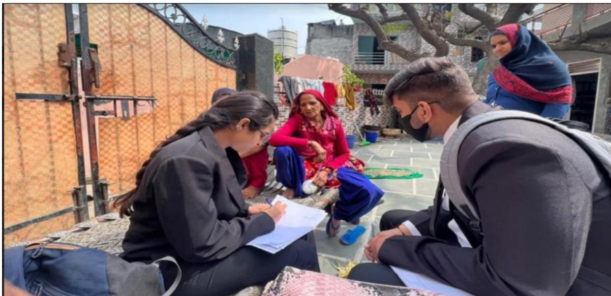
Students interacting with the Villagers

The committee have successfully done the legal counselling and provide the appropriate solutions. For further assistance, contact information was shared to those who were in need and required our continuous support for the same.