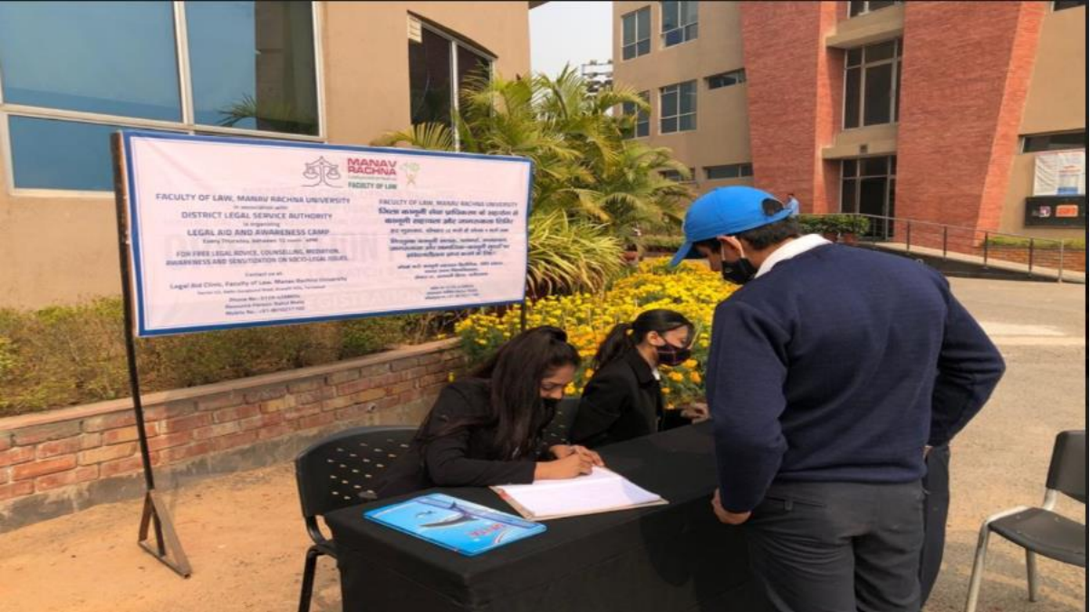
Members of Legal Aid Cell interacting with MRU students