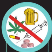
Drug Awareness Initiatives