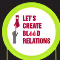
Mega Blood Donation Camp