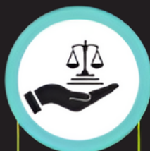
Free Legal Awareness Drives and Camps