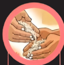
Ek Mutthi Daan