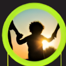
Adoption of NGOS