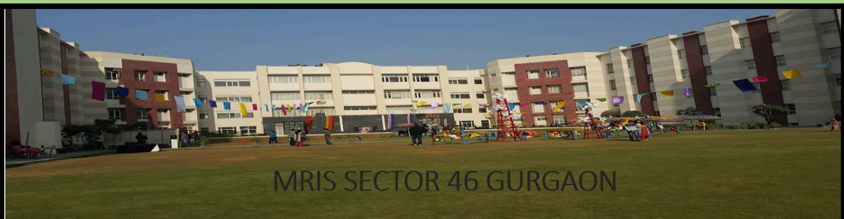
MRIS SECTOR 46 GURGAON