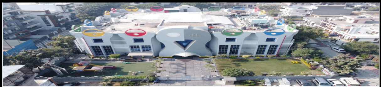
MRIS SECTOR 21 FARIDABAD