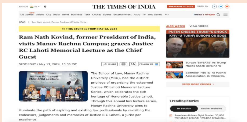
Newspaper clipping of the event

Manav Rachna University continues to provide a strong platform for dialogue, reflection, and learning through initiatives like the Justice R.C. Lahoti Memorial Lecture Series. This series was organized to honour the legacy of Hon'ble Mr. Justice R.C. Lahoti, the 35th Chief Justice of India, whose remarkable contributions to the Indian judiciary continue to inspire generations of legal minds. The event offered a space for students, faculty, and members of the legal community to engage in insightful discussions on current judicial and constitutional challenges, emphasizing Justice Lahoti's values of integrity, transparency, and commitment to democratic principles. By taking legal education beyond the classroom, Manav Rachna University enabled participants to explore real-world issues and reflect on the evolving role of law in society. The lecture series also strengthened the university's role as a thought leader in legal education connecting academia with practitioners, nurturing civic consciousness, and preparing socially responsible legal professionals dedicated to upholding justice and ethical governance.