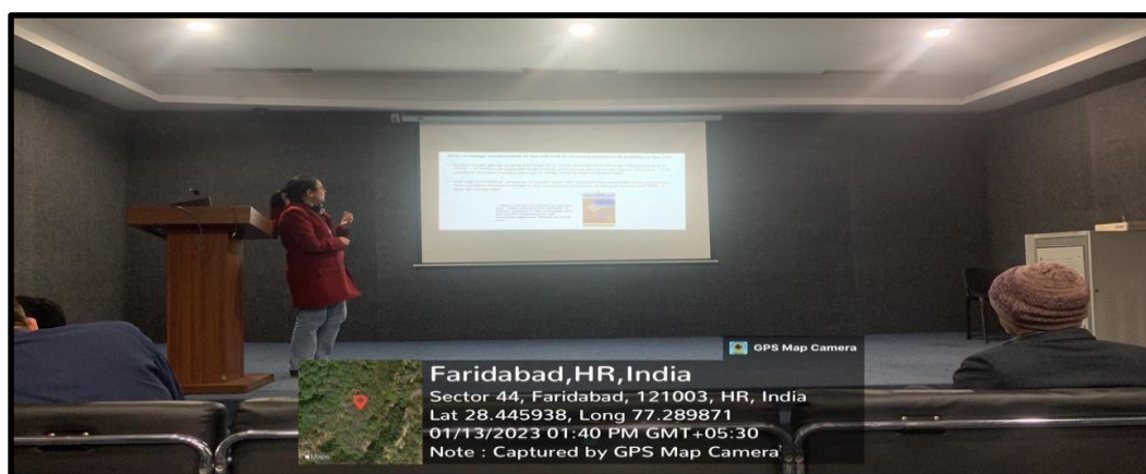
‘Bacterial resilience from single cell to colony scale using Mathematical Models on 13th January 2023’