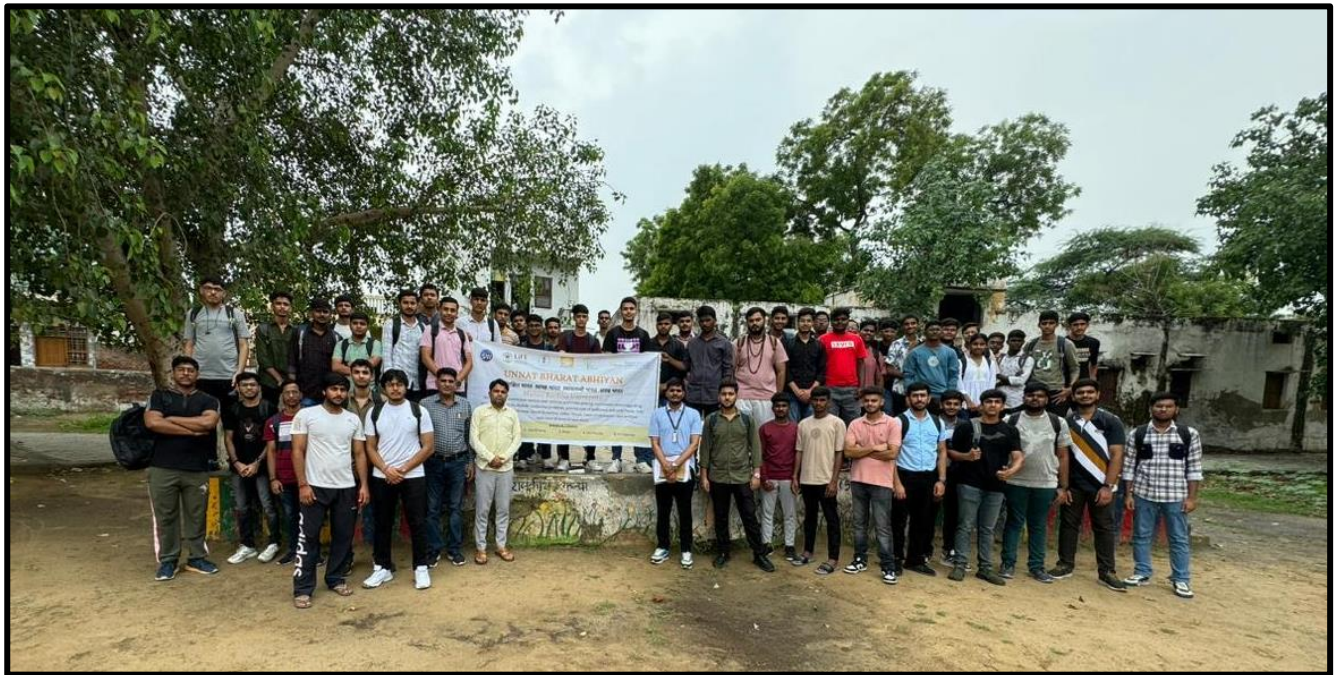
Visit to the adopted Villages - Chhainsa, Atali, Mothuka, Dayalpur, and Gadkheda