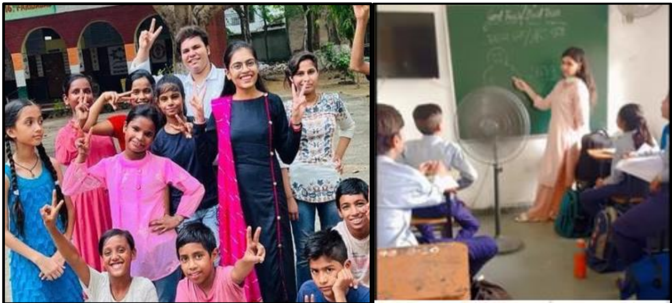
Volunteers teaching students about good & bad touch.