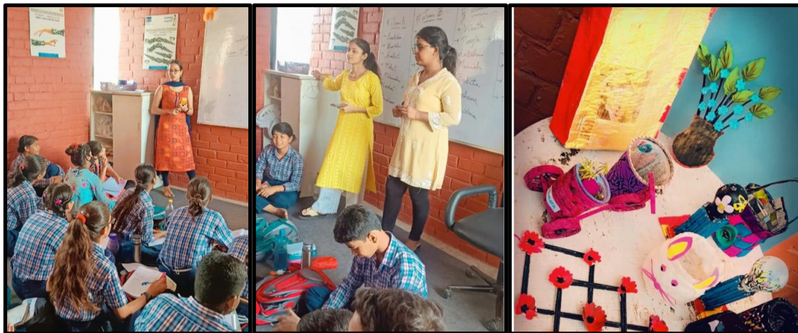
Volunteers teaching students the importance of sustainable development for future.

The event went beyond theoretical learning, as MRCPS volunteers organized various hands-on activities aligned with the SDGs. From eco-friendly projects to collaborative efforts focusing on social responsibility, the students actively participated, gaining practical insights into the principles of sustainable development. The visit not only contributed to the academic growth of the students but also left a lasting impact by inspiring them to become conscientious contributors to a sustainable and harmonious future.