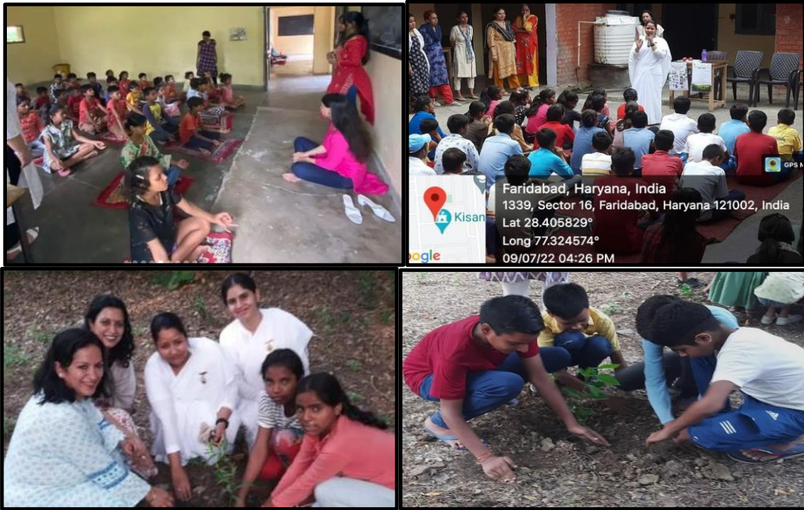
Peace and motivations sessions and plantation drive.