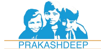
Prakashdeep Trust Schools