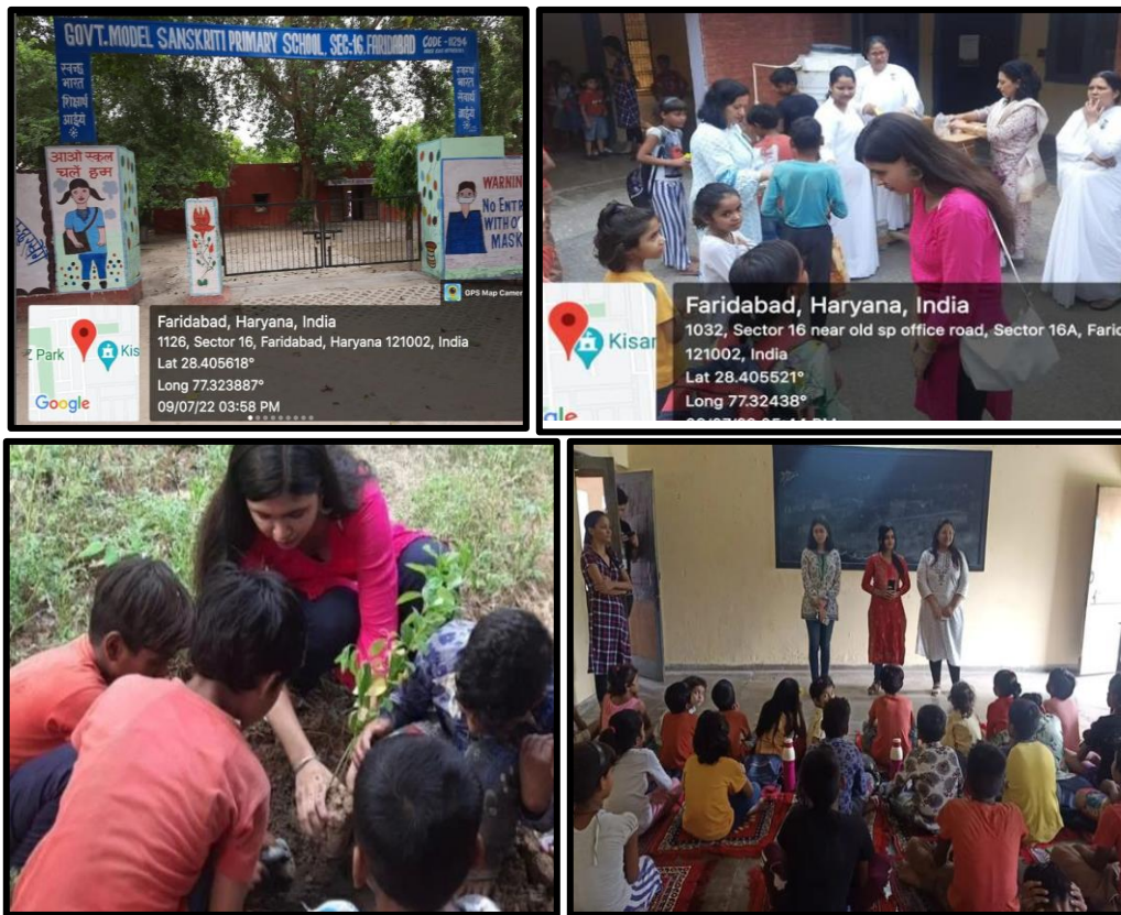
Volunteers interacting with school students and teaching them about peace and sustainability

students basic breathing techniques, yoga asanas, and meditation practices to help reduce stress and improve concentration. Additionally, interactive workshops educated participants on the significance of trees, biodiversity, and conservation, reinforcing the values of environmental stewardship. Through these activities, students gained practical insights into conservation and the importance of mental and physical well-being, fostering a strong sense of community engagement. This initiative served as a vital step toward a sustainable and peaceful future, aligning with the core objectives of MRCPS. The organizers extend their gratitude to all participants, with special thanks to Jagruti Sewa Trust for their partnership and the host school for their support.