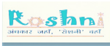
Roshni Education Society, Faridabad