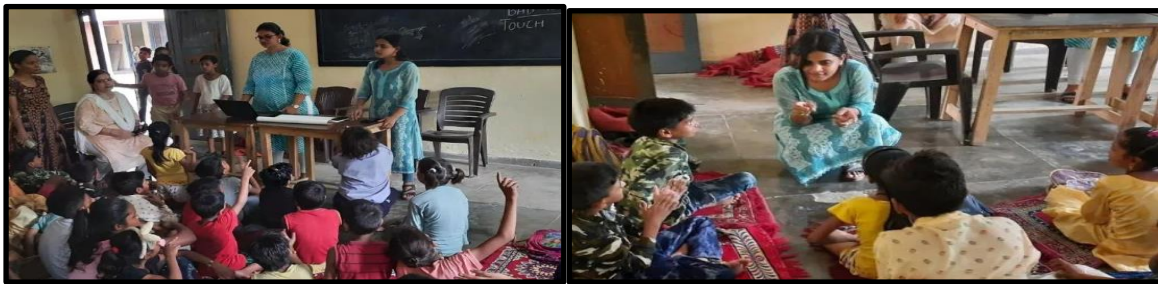
Showing a video to students about a girl who suffered bad touches from her neighbor.

bad touch. The video, thoughtfully curated to be age-appropriate and impactful, served as an additional layer of engagement, effectively complementing the interactive sessions. This multimedia approach not only catered to different learning styles but also enhanced the overall effectiveness of the program. The incorporation of a video component demonstrated the organization's commitment to employing diverse and innovative strategies to ensure that the vital message of personal safety resonated with the students in a meaningful and memorable way. Through this holistic approach, the Manav Rachna team successfully fostered a safe and nurturing environment for the children while addressing a critical aspect of their holistic development.