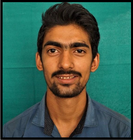
Pre-op portrait image