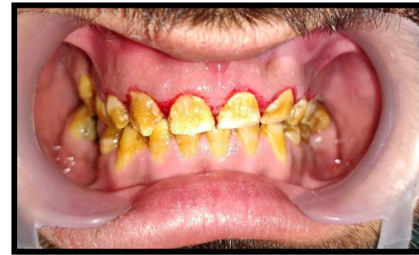
Gingivectomy performed according to wax-up