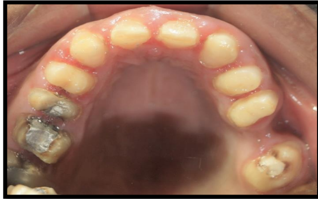
Tooth preparation done (maxillary)