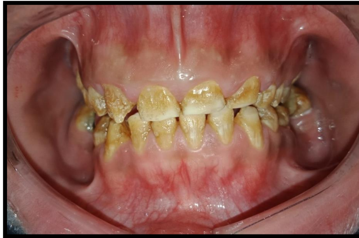
Pre-op Intra-oral view