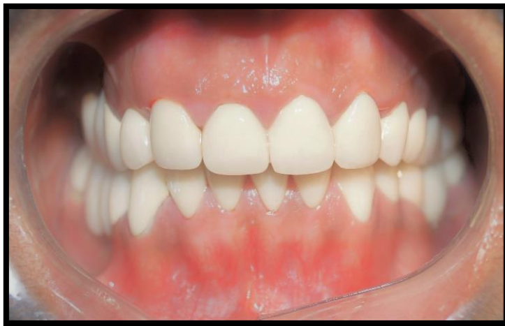
Post-op intraoral view