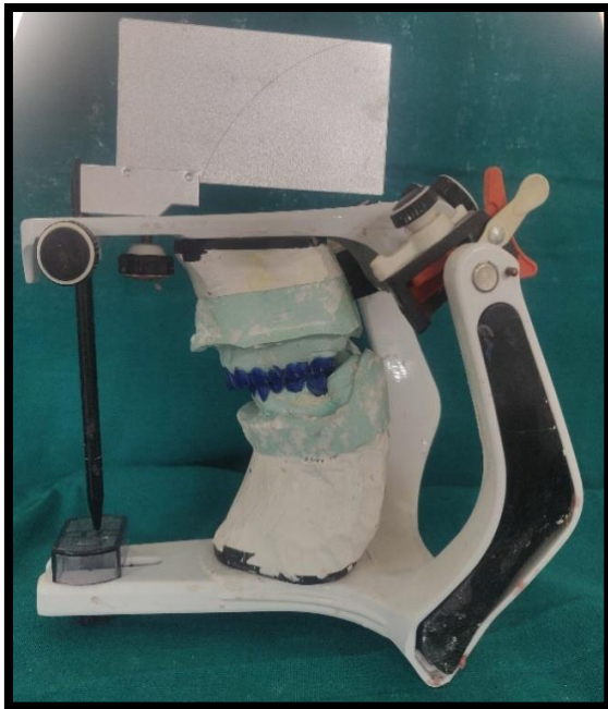
Wax-mock up using Broadrick flag analyzer