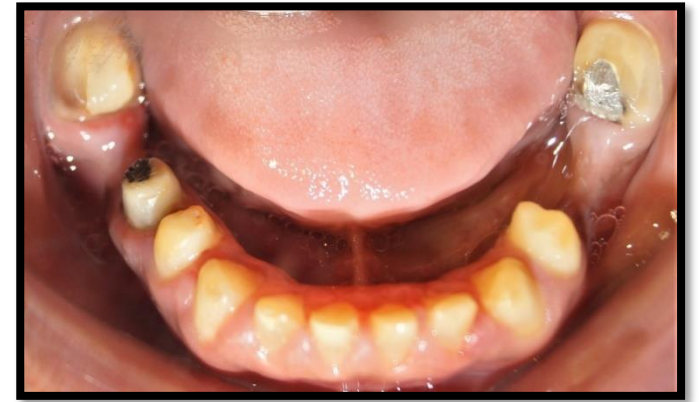
Tooth preparation done (mandibular)