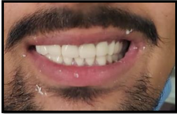
Temporization done with bis-acrylate follow-up for 8 weeks