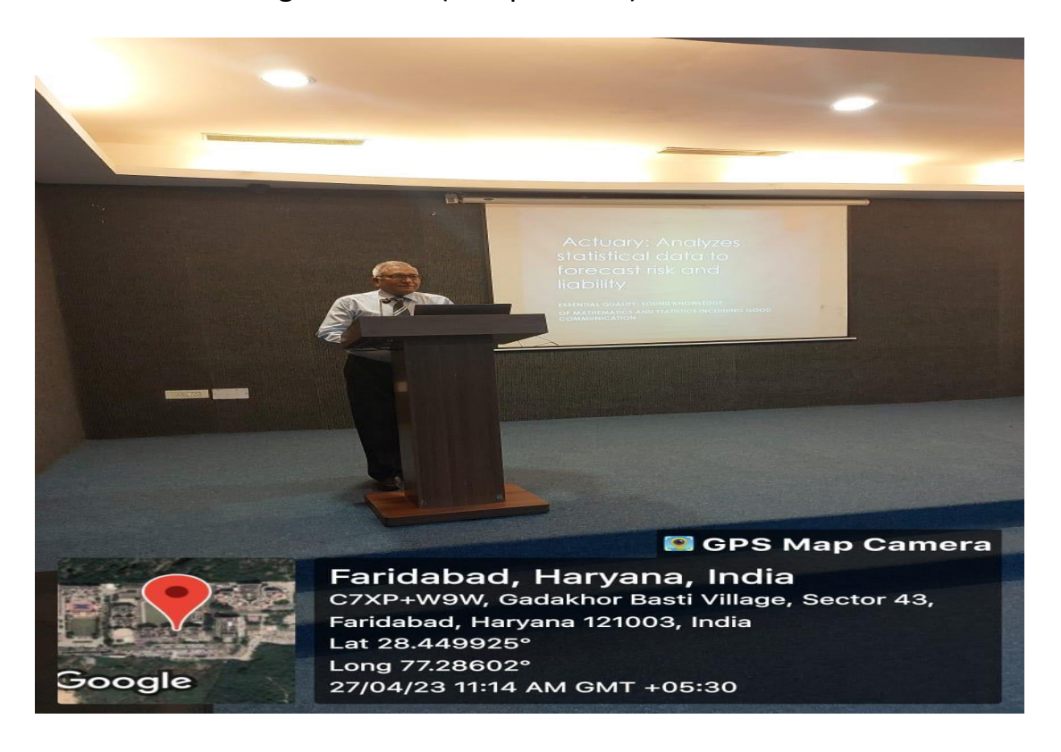
Speaker is Presenting(27 April 2023)