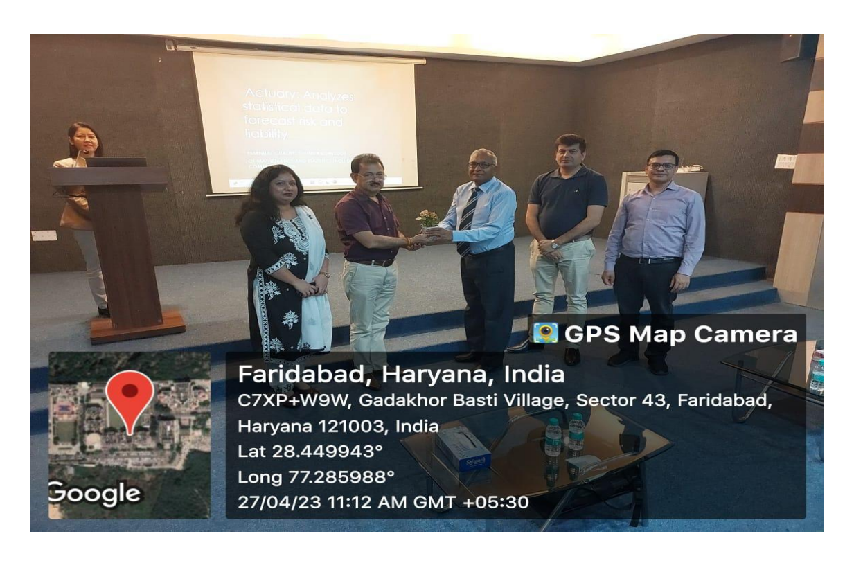
Welcoming of Guest (27 April 2023)