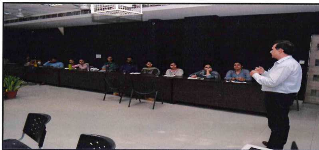
Dean Research Presenting Content During orientation program