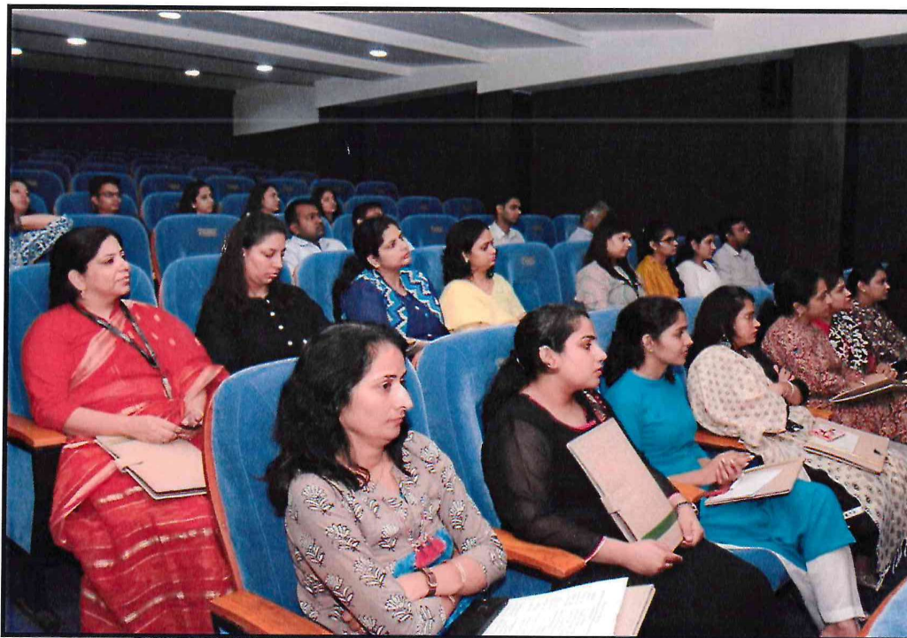
Newly joined employees of the session 2017-18

An Induction Program for newly joined Faculty/Staff members of MRU was conducted on 29th July 2017 by the central HR team in collaboration with Internal Quality Assurance Cell. The objective of the induction program is to make the faculties aware about institutional infrastructure, regulations and other various requirements in academics.