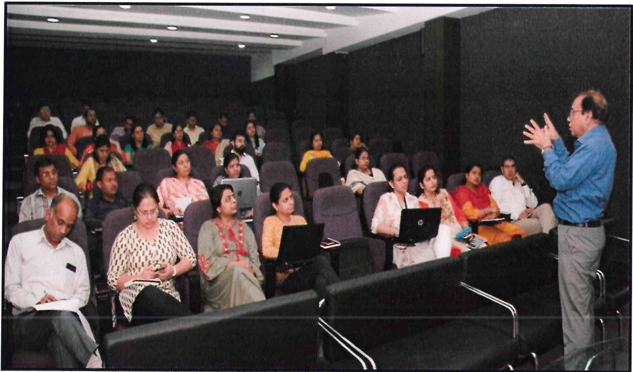
Session in Progress along with interaction with Faculty members