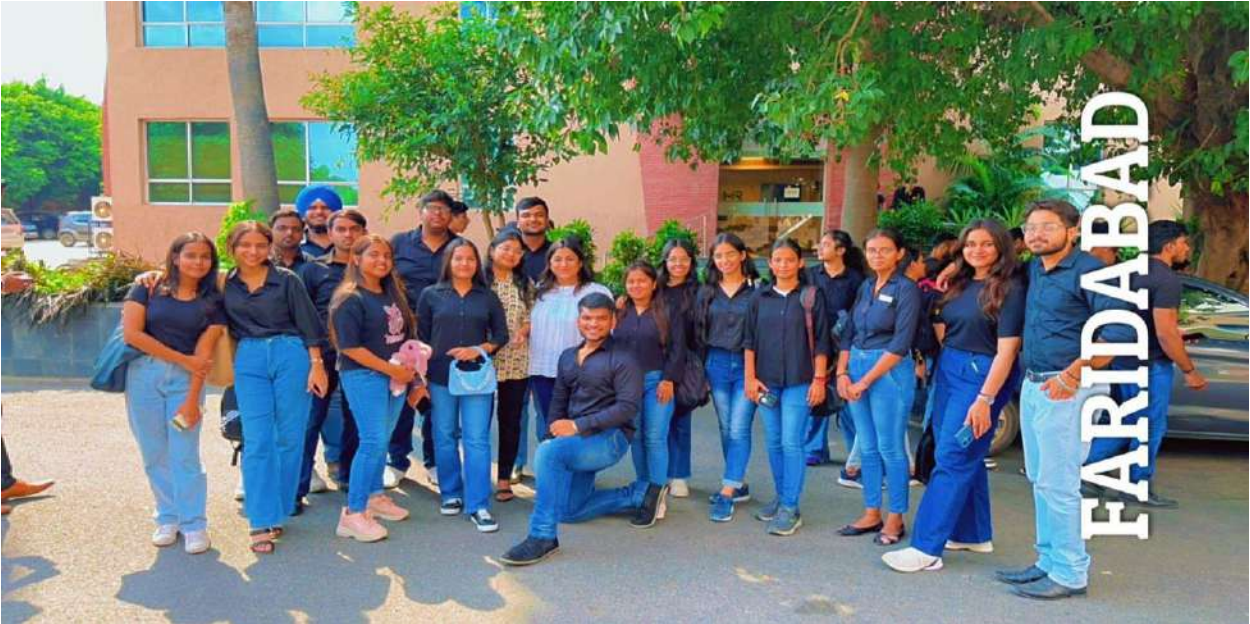
Pitchdeck – A Sustainable Idea Competition