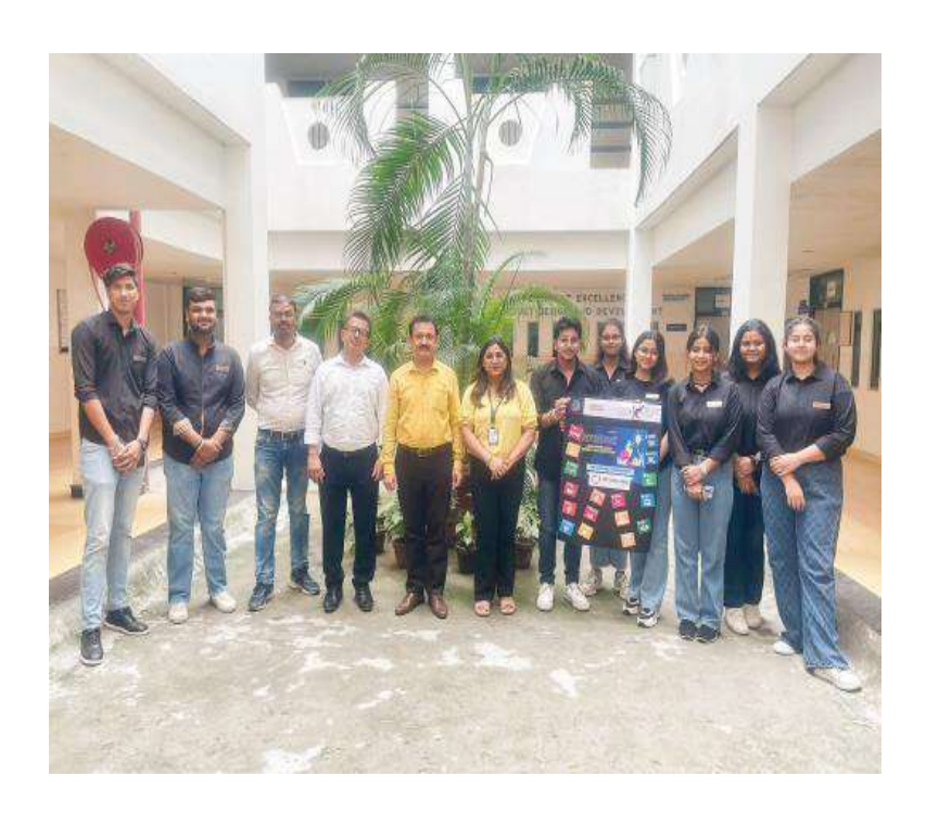
Global Startup & Entrepreneurship Conclave- 24 February, 2023