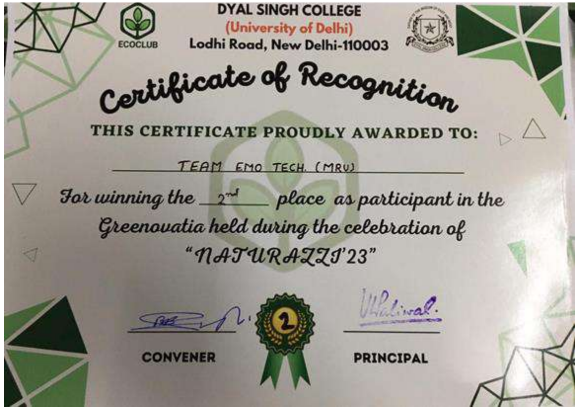
Empower X Change