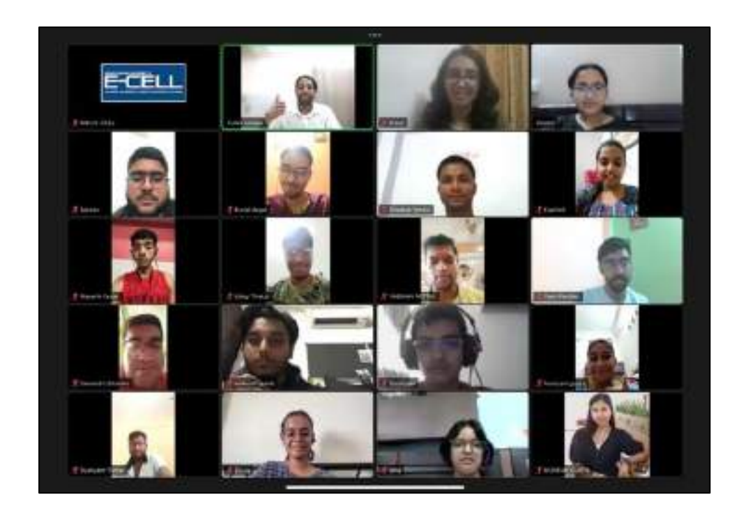
Workshop Report on InnoCyber Mastery - Bridging Skills and Innovation

Institution Innovation Council (IIC) of Manav Rachna University organized a 5 days long event of "InnoCyber Mastery: Bridging Skills and Innovation" from 11<sup>th</sup> September 2023 to 15<sup>th</sup> September 2023. The objective of this workshop is to provide participants with valuable comprehensive exploration of key cybersecurity topics to innovation and research. Participants explored new cybersecurity tools, techniques, or methodologies, contributing to the advancement of knowledge in the cybersecurity field.