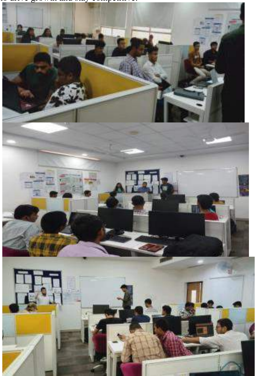
Pitchdeck - A Sustainable Idea Competition

development to drive growth and stay competitive.