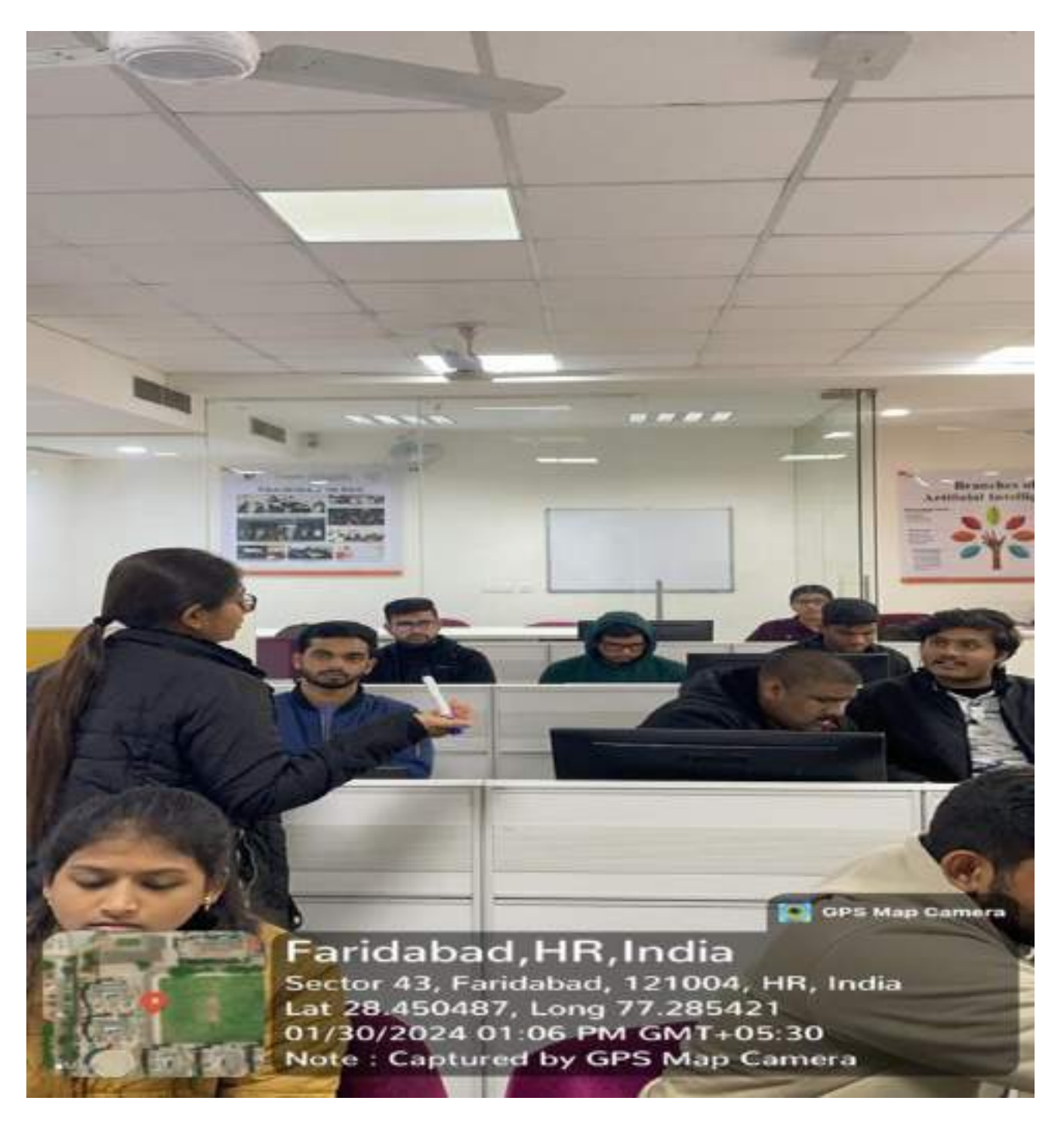
Unleashing Innovation: Machine Learning Essentials for Beginner