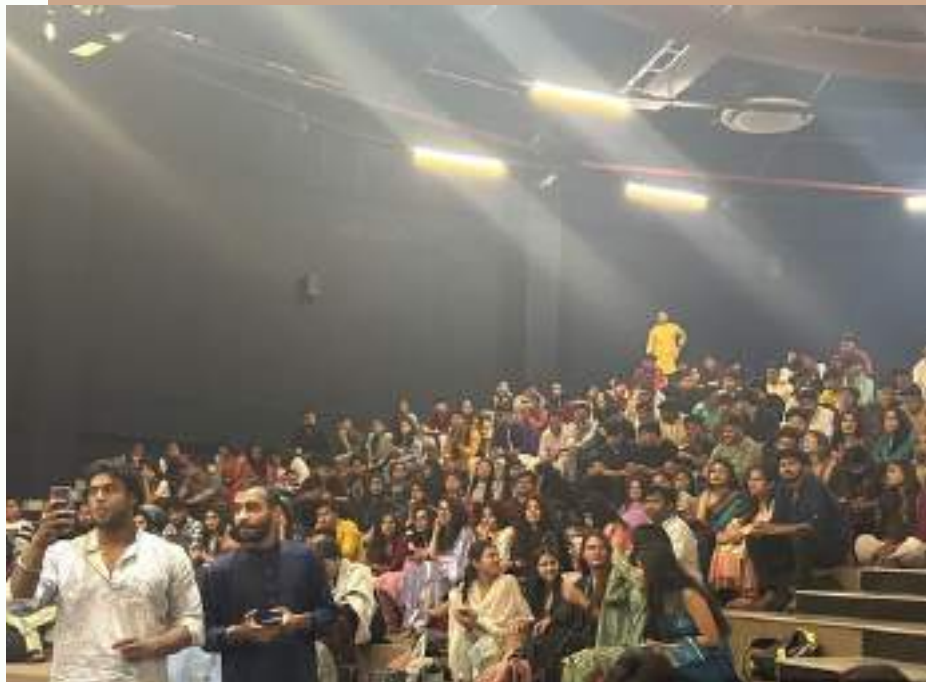
Students gathered in Mandala Auditorium for Ethnic Day